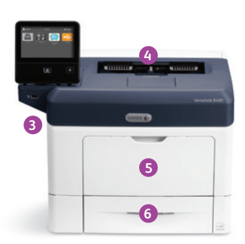
Xerox® VersaLink® B400 Printer Print.