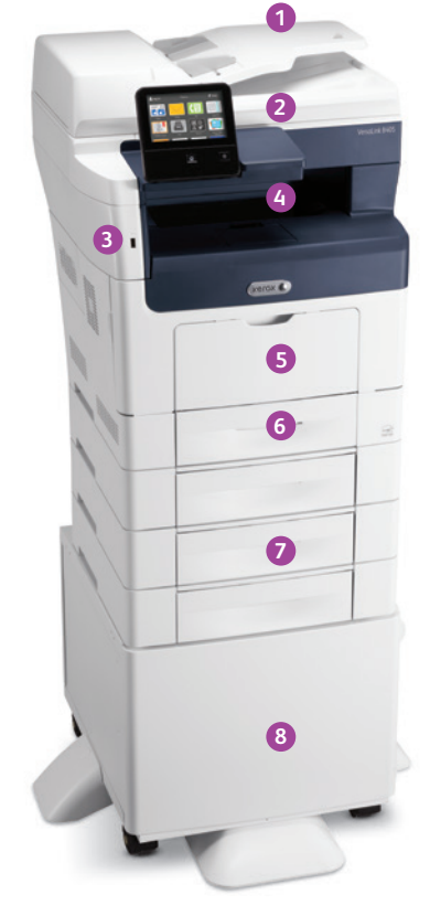
Xerox<sup>®</sup> VersaLink<sup>®</sup> B405 Multifunction Printer Print. Copy. Scan. Fax. Email.